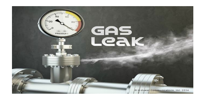
Fig.1. Gas leakage schematic diagram

ARM Cortex is enhanced for low cost an energy efficient Microcontroller. It is a high performance 32-bit processor which offers significant benefits to the developers. The ARM Microcontroller runs at 100 MHz frequency and high performance therefore it supports the high level languages