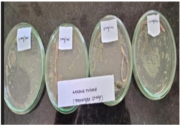
Fig .3. Aqueous Extract (Paralyze Stage).