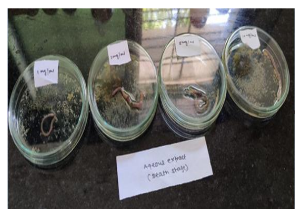
Fig.5. Aqueous Extract (Death Stage).