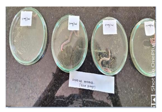
Fig.2. Aqueous extract (Live Stage).