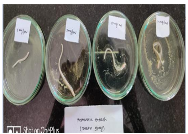
Fig .4. Methanolic Extract (Death Stage).