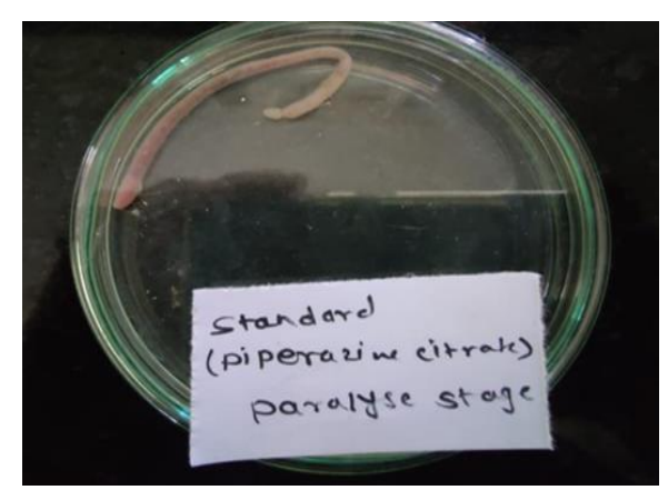
Fig .7. Standard Piperazine citrate (Paralyze Stage).