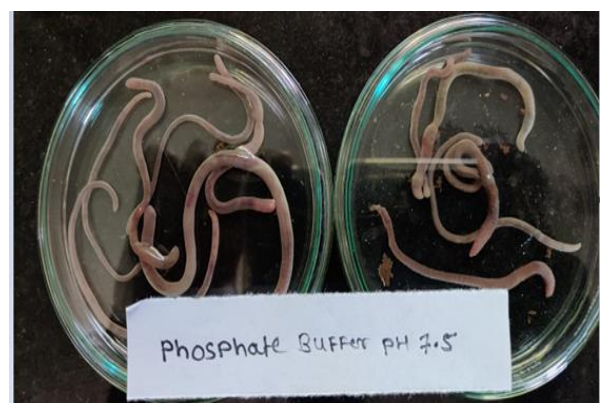
Fig.1. Phosphate Buffer PH 7.5

In conclusion the use of pods of canavalia Ensiformis as Anthelmintic have been confirmed as the pods extract displayed activity against the worms in the study.